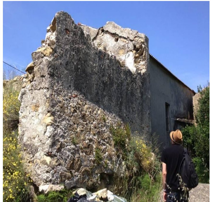
Ruins of S. Anastatius church