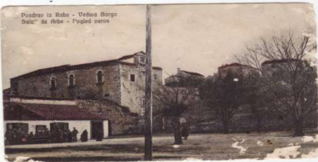
Pozdrav iz Raba - Vedura Borgo Sale" da Arbe - l'ogled baros